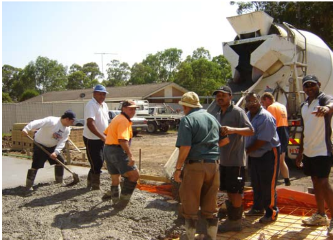
Members helping during construction