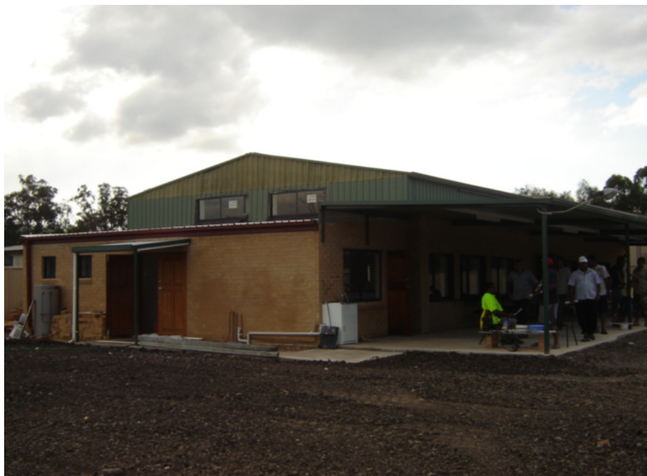
View from South