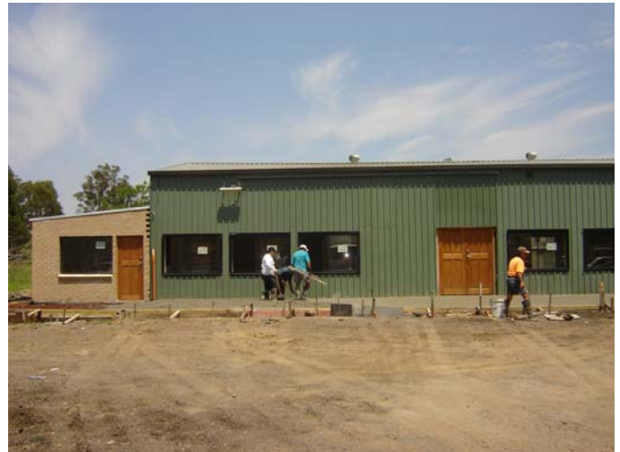
Front view during construction